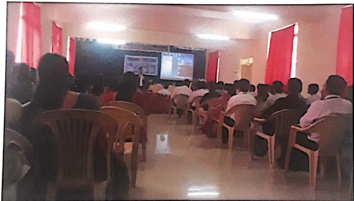
Principal welcoming the parents in Parents Meet